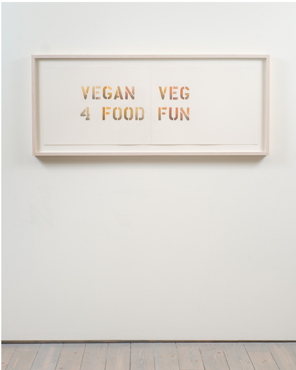
Nadia Myre Vegan Veg for Food Fun, 2007 watercolour on paper 53 x 23"