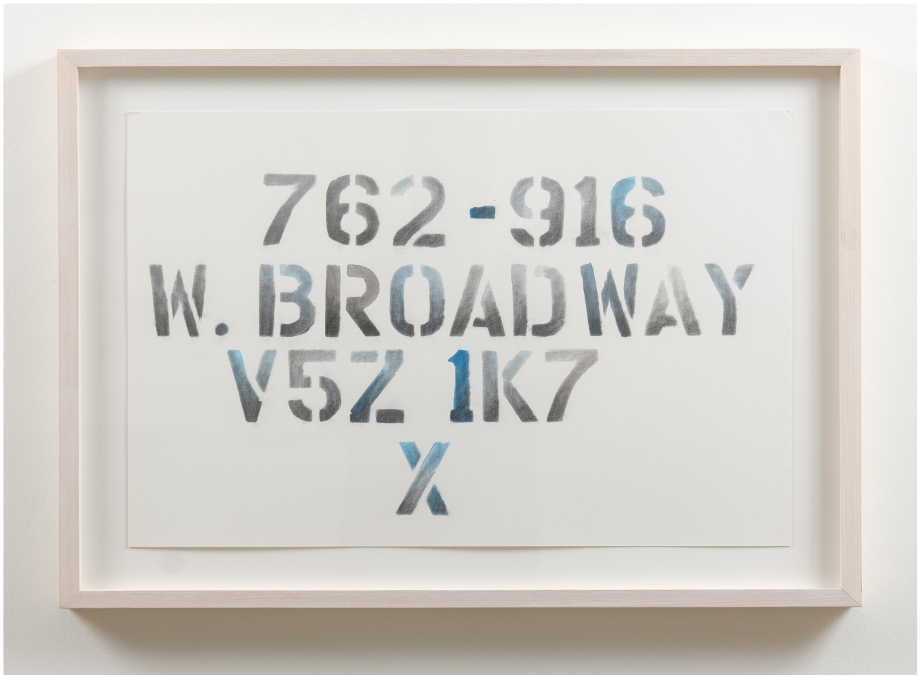
Nadia Myre 762-916, 2007 Watercolour on paper 29 x 23"