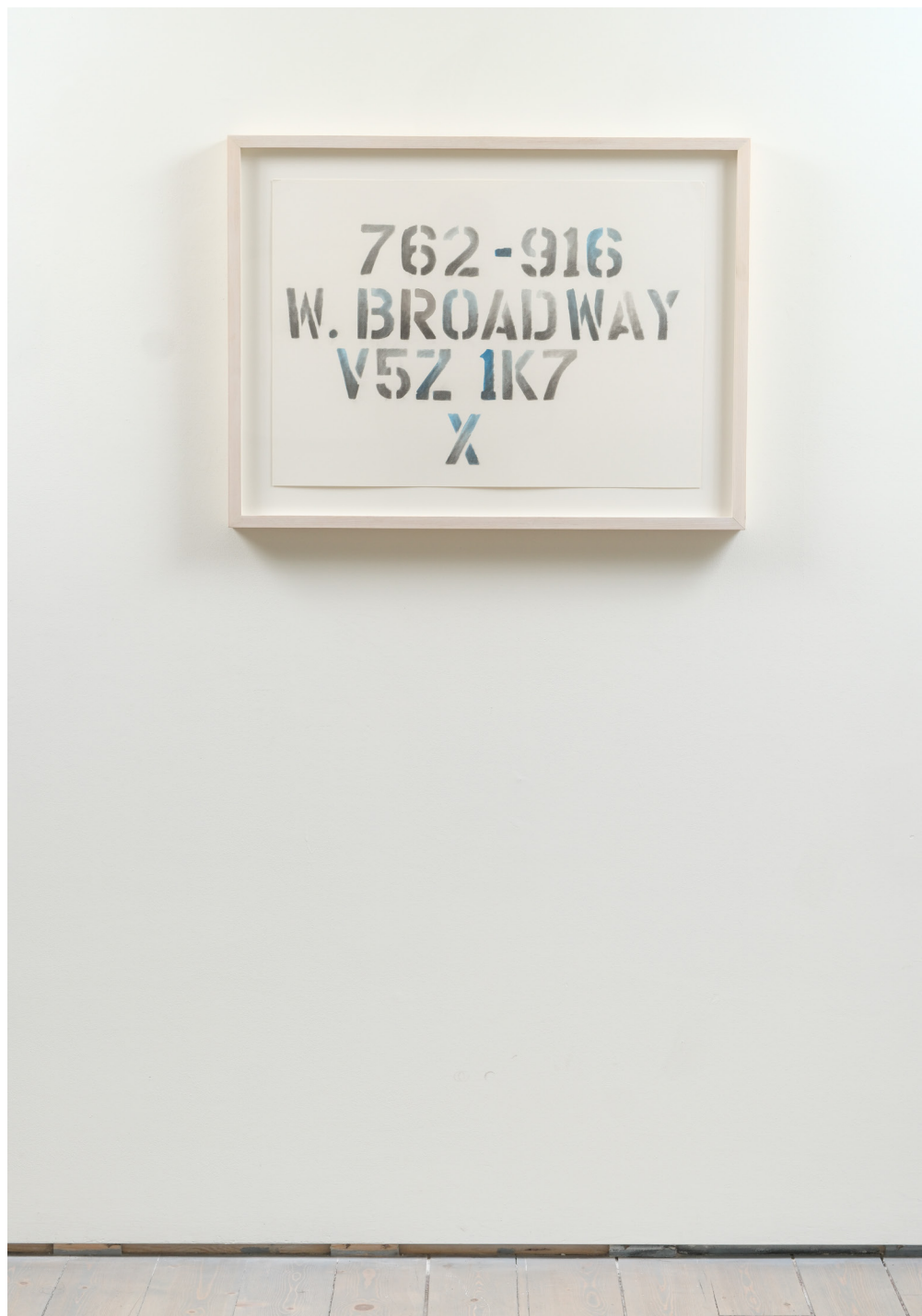
Nadia Myre 762-916, 2007 Watercolour on paper 29 x 23"