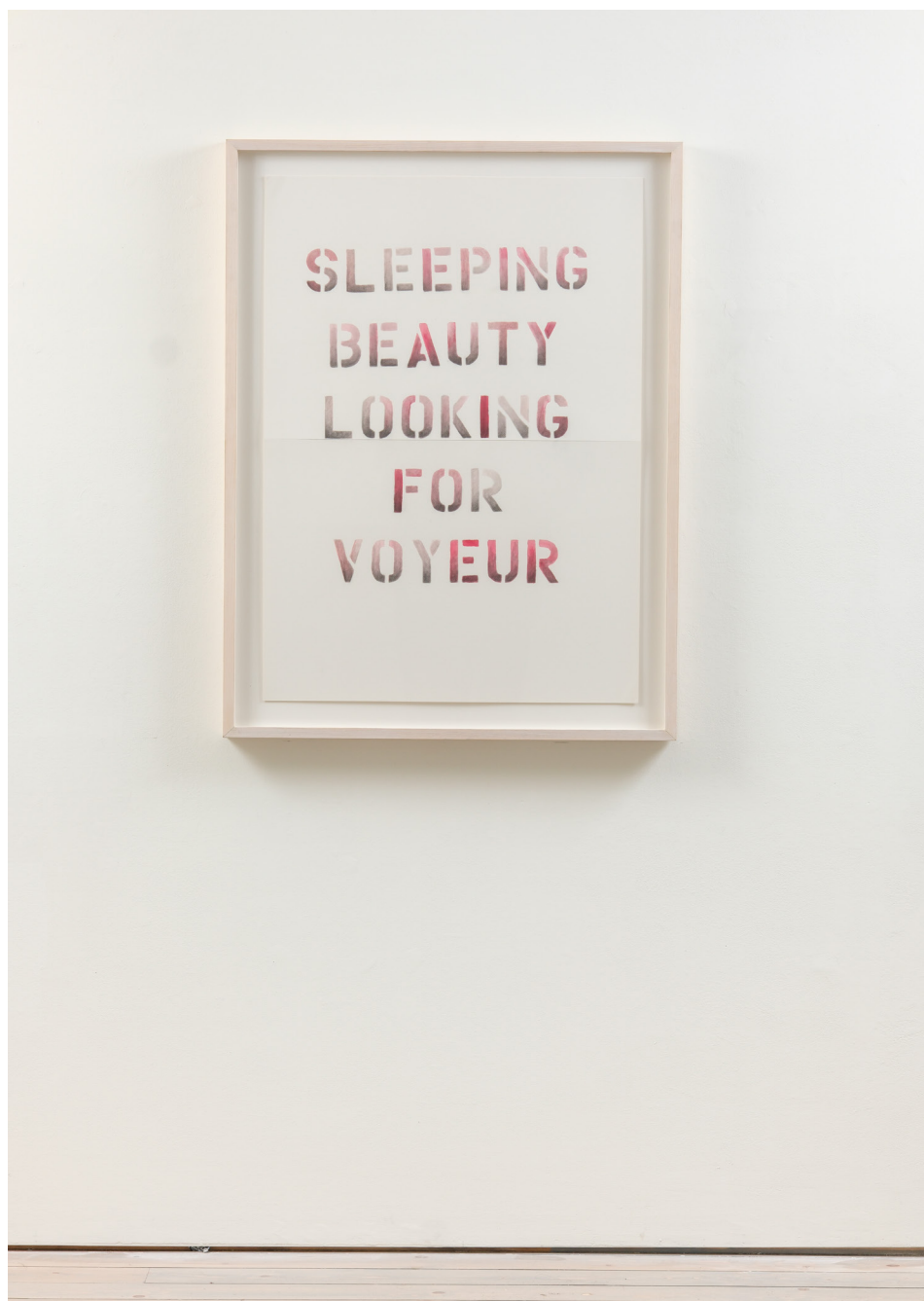
Nadia Myre Sleeping Beauty Looking , 2007 Watercolour on paper 29 x 41"