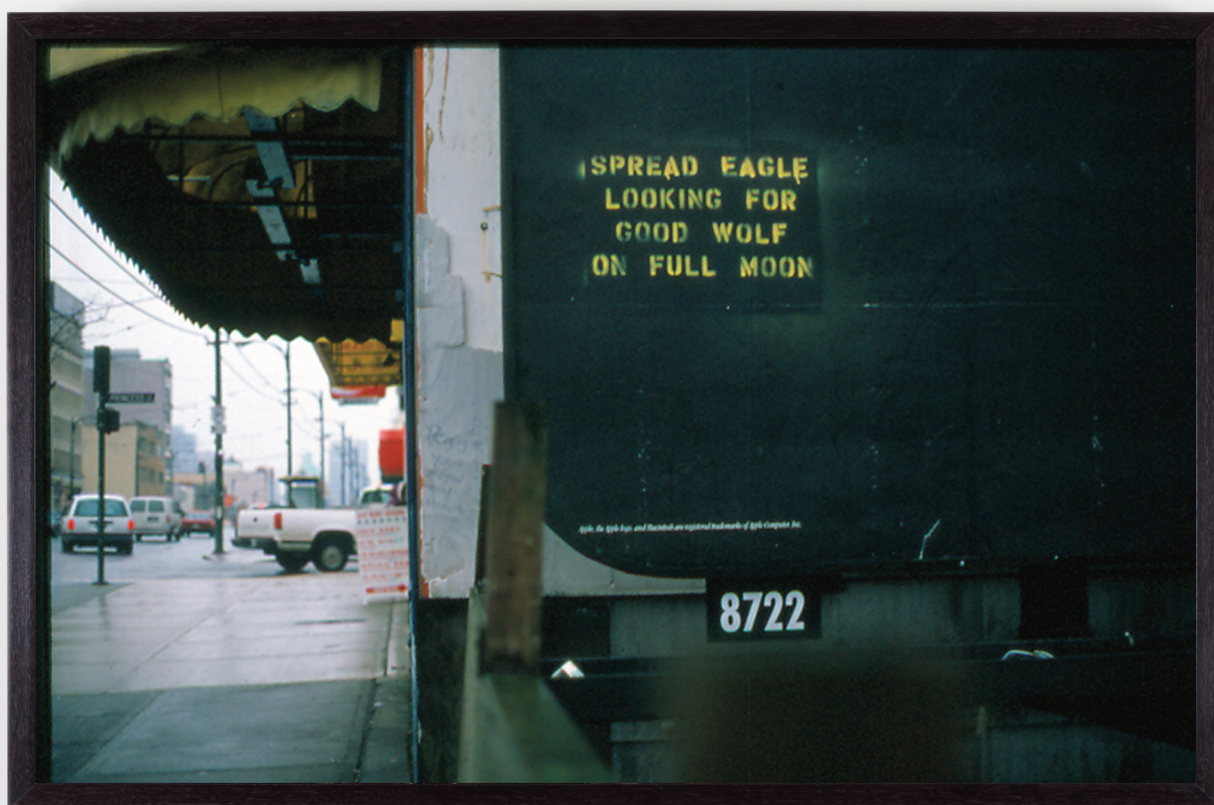
Nadia Myre Spread Eagle East Hastings, 1997 Inkjet print on archival paper 31 x 21" Ed of 5