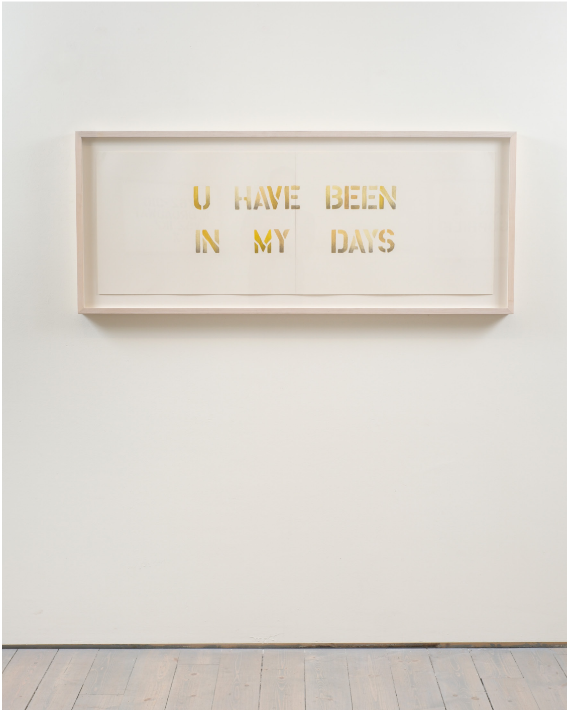
Nadia Myre U Have Been in My Days , 2007 Watercolour on paper 53 x 23"