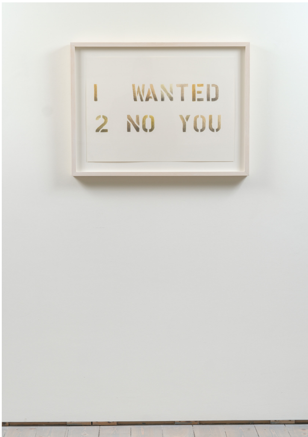
Nadia Myre I Wanted 2 No You , 2007 Watercolour on paper 29 x 23"