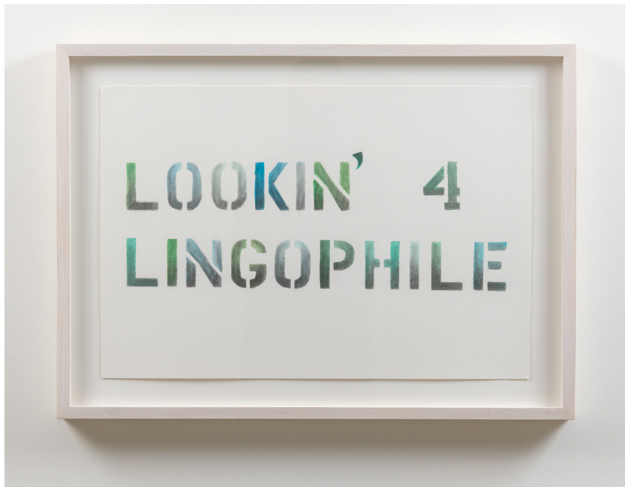
Nadia Myre Looking for Lingophile, 2007 Watercolour on paper 29 x 23"