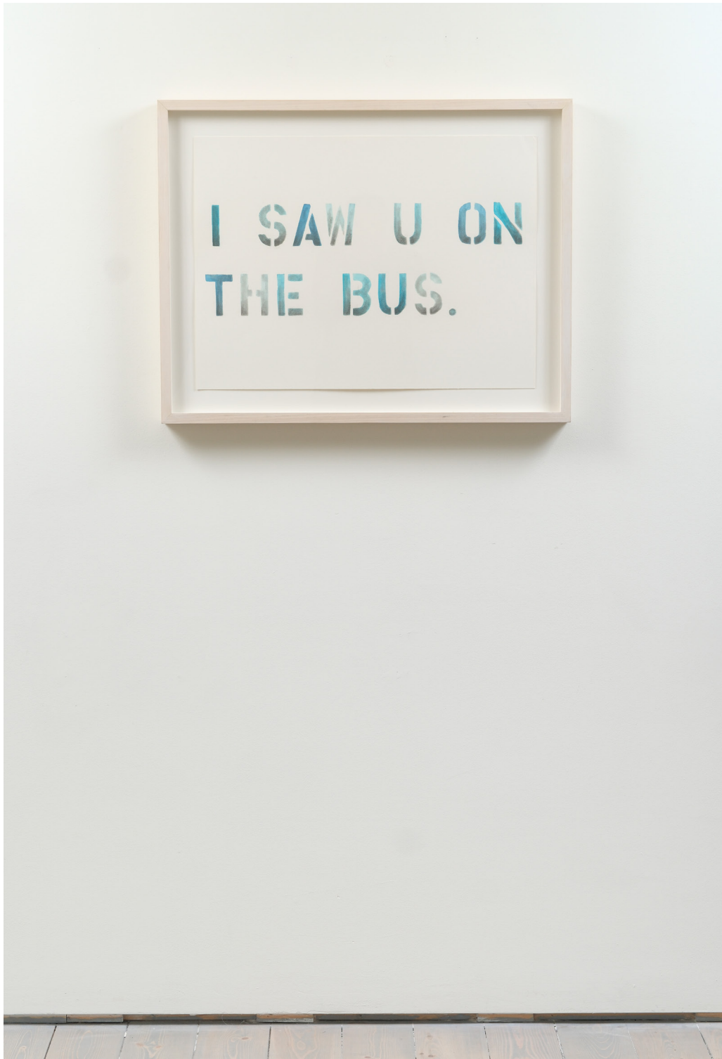
Nadia Myre I Saw You on the Bus , 2007 Watercolour on paper 29 x 23"