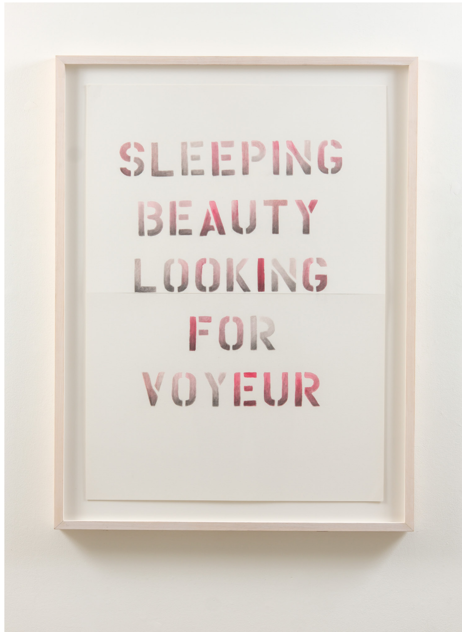
Nadia Myre Sleeping Beauty Looking , 2007 Watercolour on paper 29 x 41"