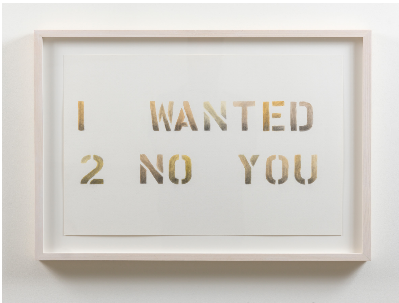
Nadia Myre I Wanted 2 No You, 2007 Watercolour on paper 29 x 23"