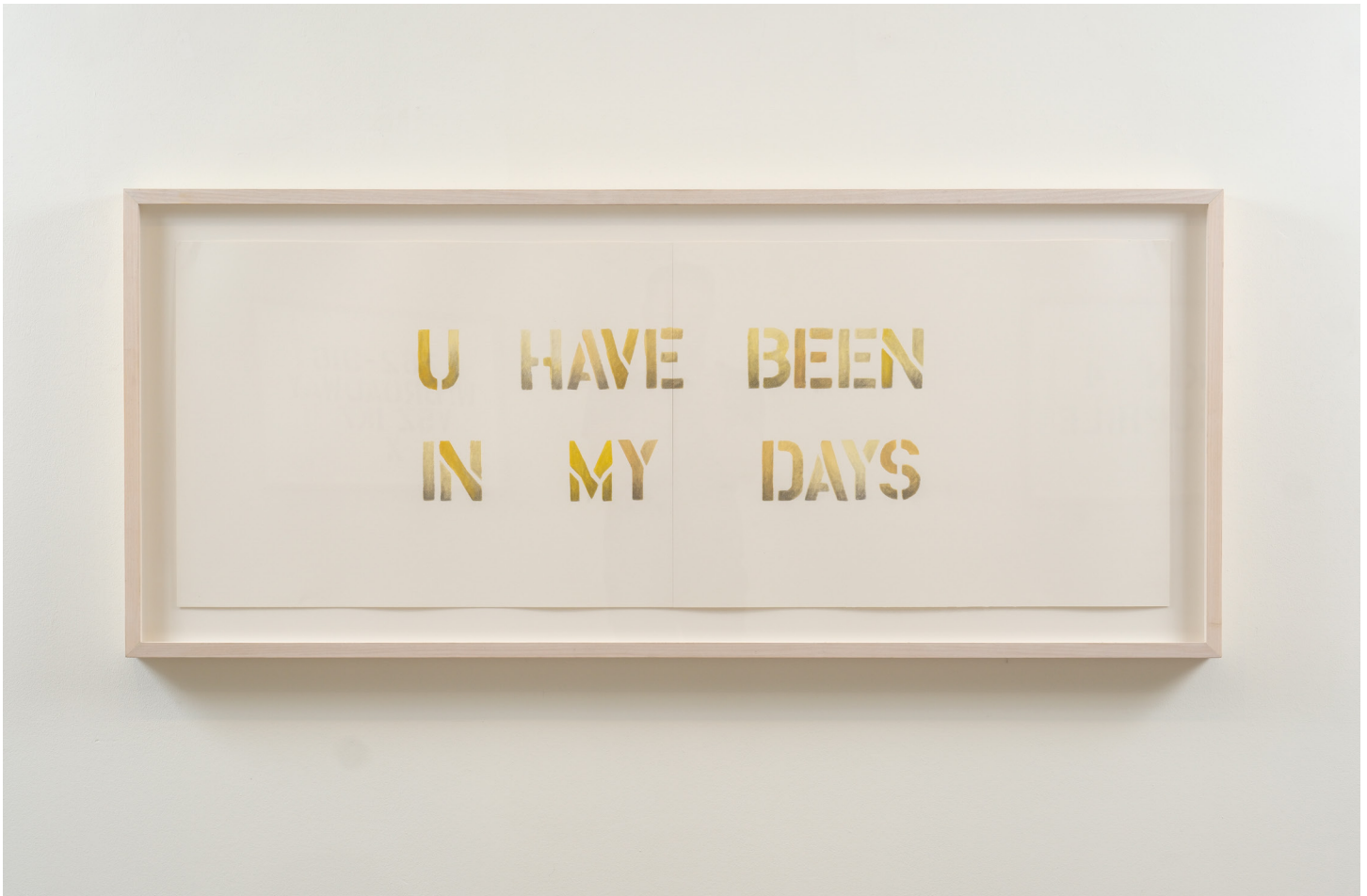
Nadia Myre U Have Been in My Days , 2007 Watercolour on paper 53 x 23"