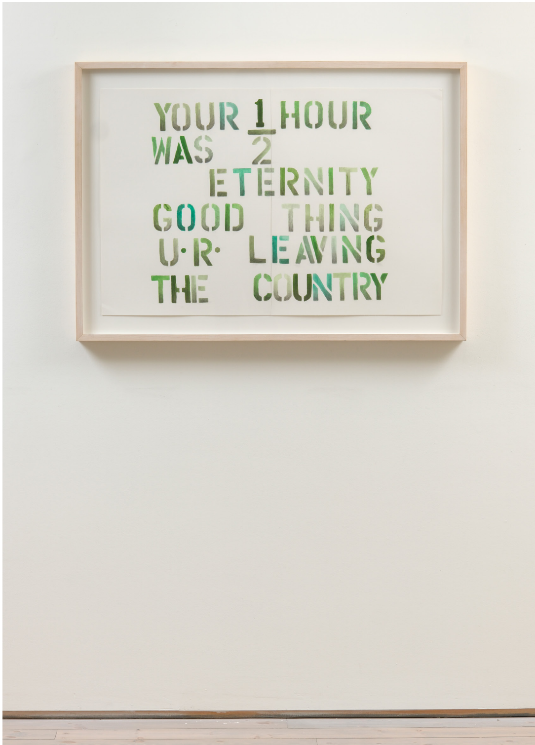
Nadia Myre Your 1/2 hour was eternity, 2007 Watercolour on paper 41 x 29.5"