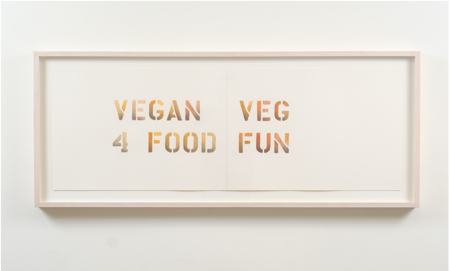
Nadia Myre Vegan Veg for Food Fun, 2007 watercolour on paper 53 x 23"