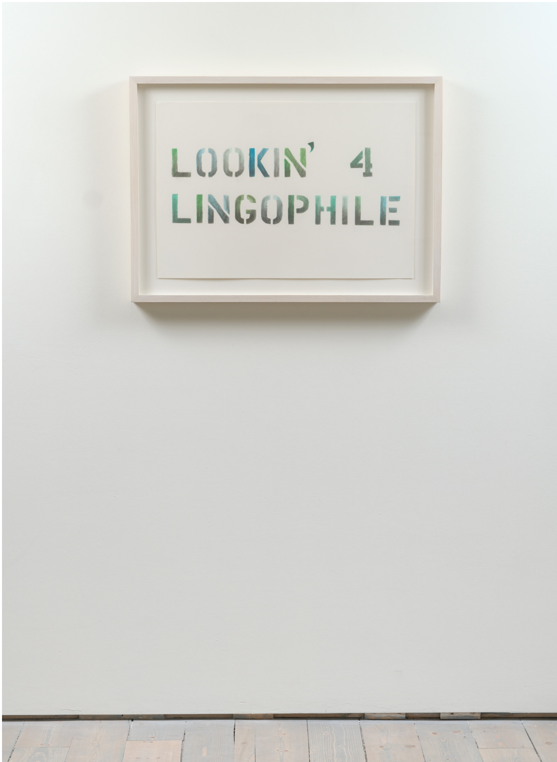
Nadia Myre Looking for Lingophile, 2007 Watercolour on paper 29 x 23"