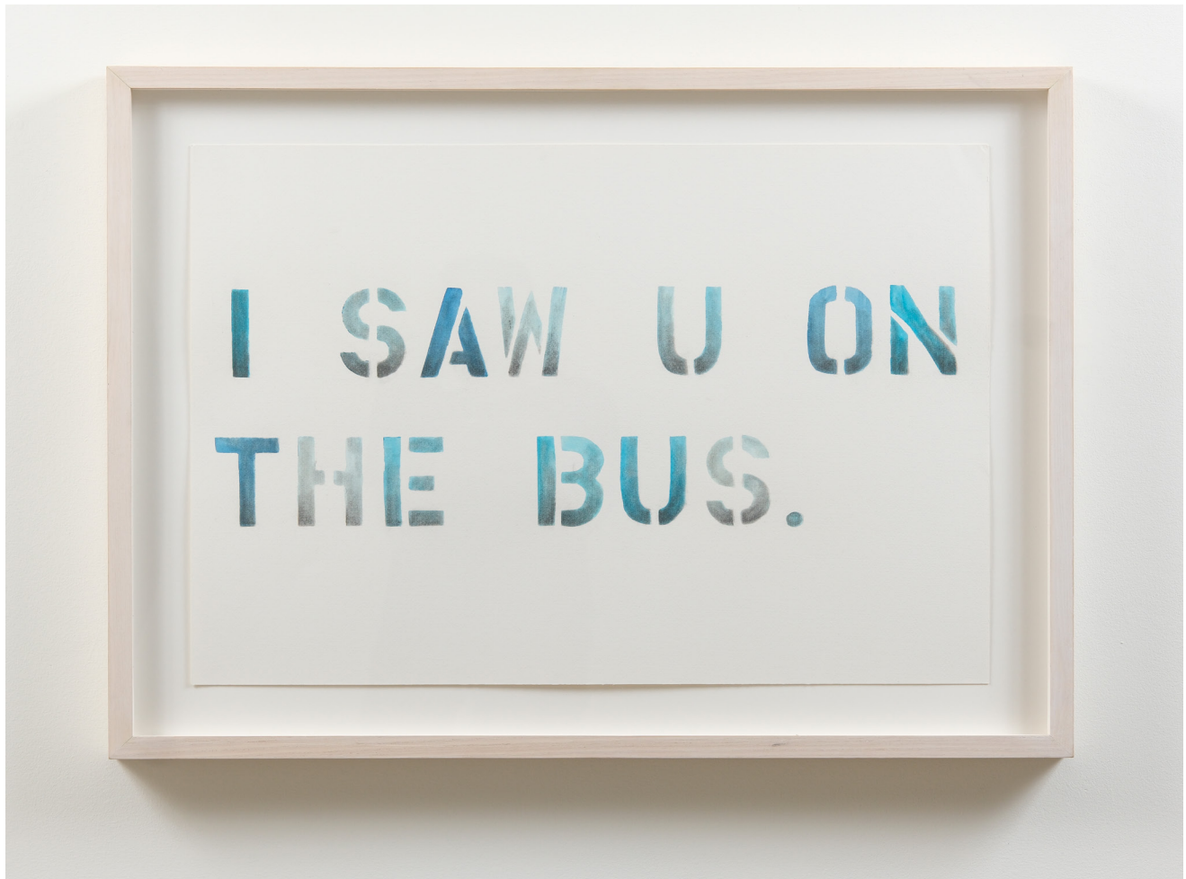
Nadia Myre I Saw You on the Bus , 2007 Watercolour on paper 29 x 23"