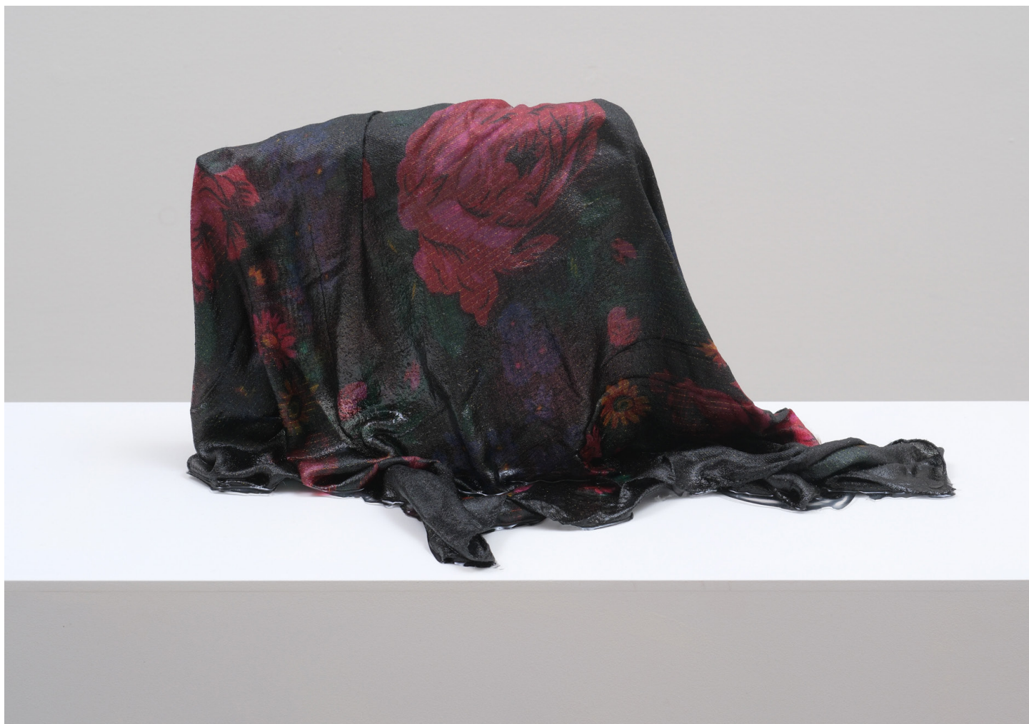
Jeneen Frei Njootli TBD (drill) , 2024 Epoxy cast of drill with scarf 18L x 10.25W x 9.5H" $12,000