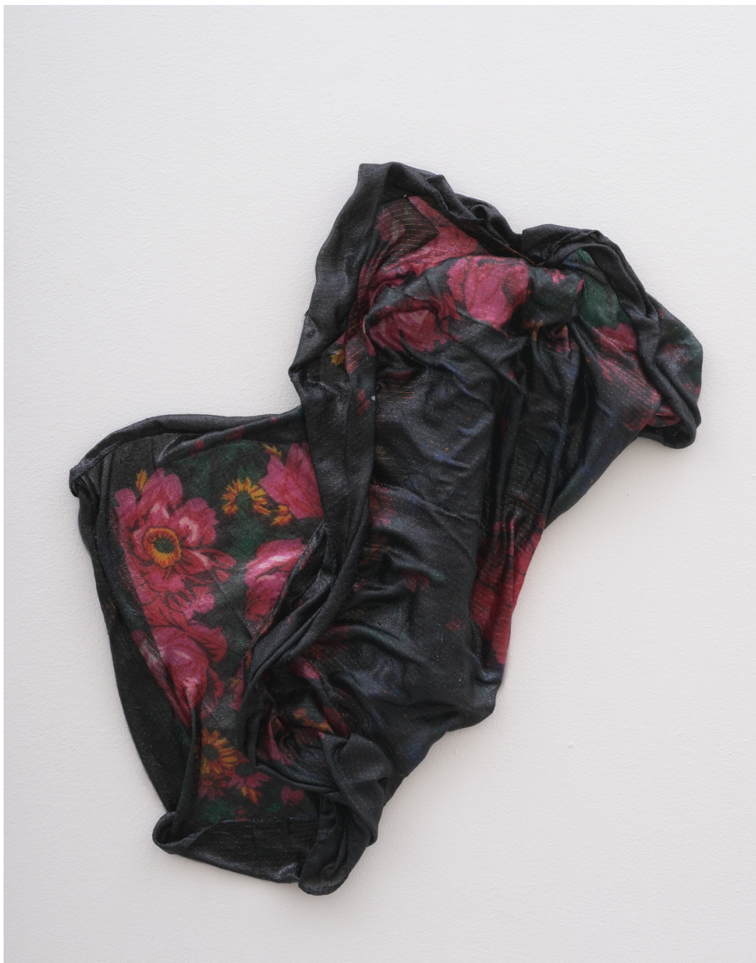
Jeneen Frei Njootli TBD (hammer) , 2024 Epoxy cast of hammer with scarf 21.5L x 13.5W x 5H" $15,000