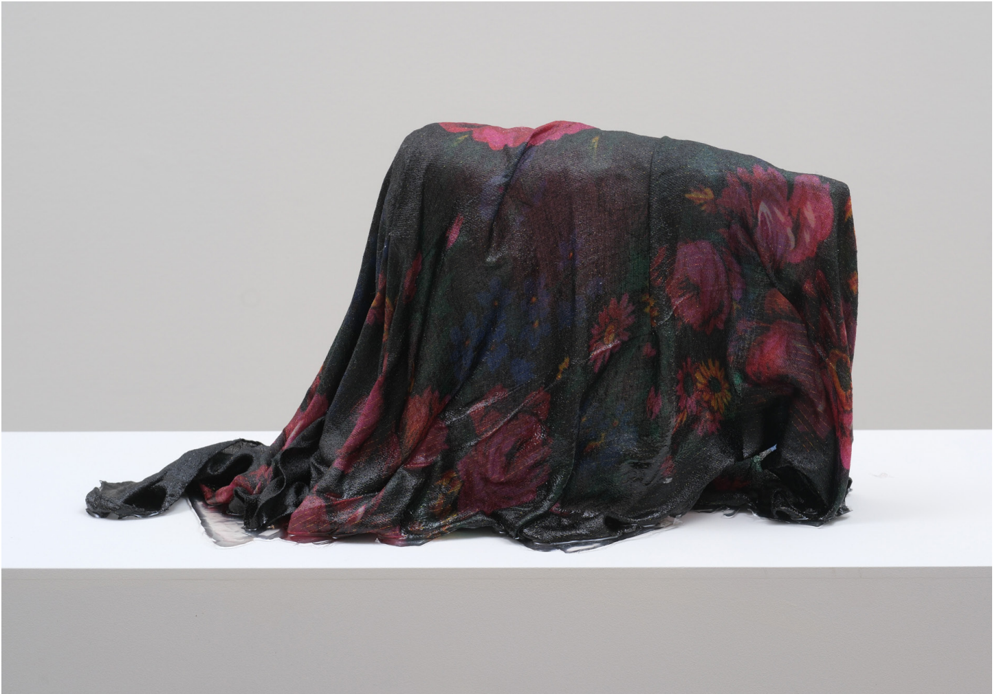
Jeneen Frei Njootli TBD (drill) , 2024 Epoxy cast of drill with scarf 18L x 10.25W x 9.5H" Alternate angle