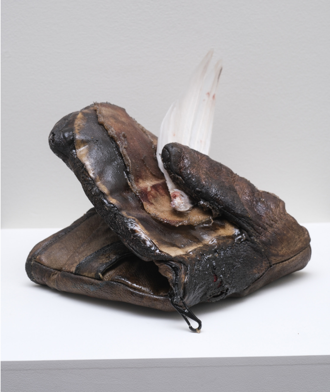
Jeneen Frei Njootli TBD (glove with wing) , 2024 Leather, fleece lined glove, ptarmigan wing, epoxy 6.25L x 7W x 7.5H" $15,000