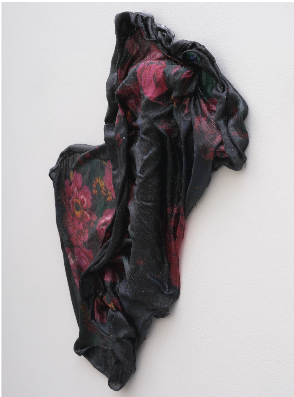
Jeneen Frei Njootli TBD (hammer) , 2024 Epoxy cast of hammer with scarf 21.5L x 13.5W x 5H" Alternate angle