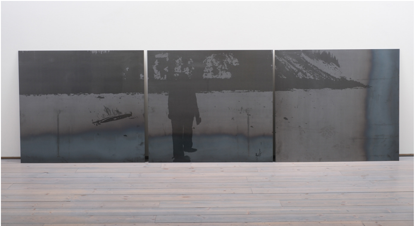
Jeneen Frei Njootli As we process this loss, 2024 Hot rolled steel, epoxy 108 x 36" $30,000