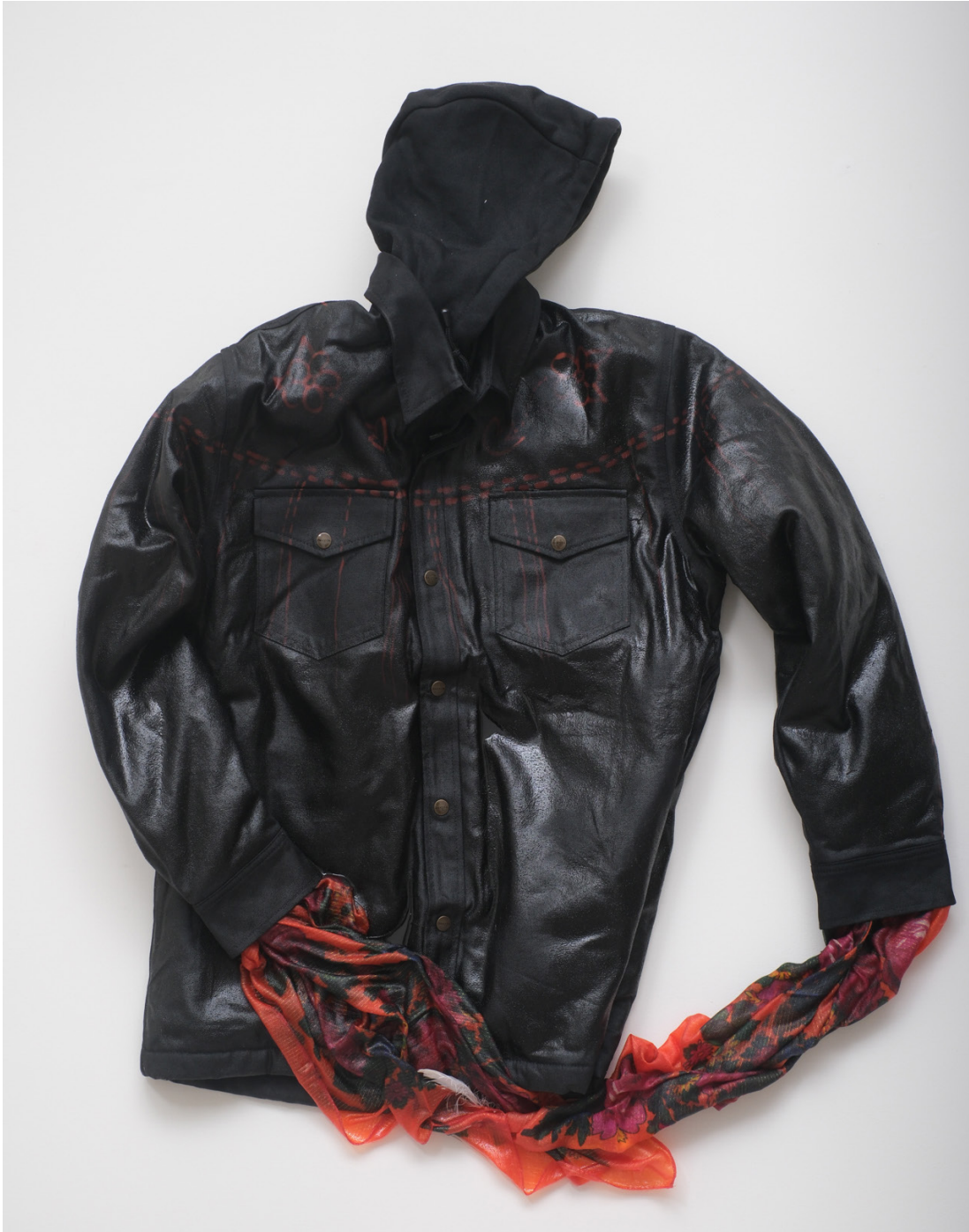
Jeneen Frei Njootli Against erasure , 2024 Work jacket, bleach, scarves, ptarmigan feather, epoxy 42L x 37.5W x 7.5H" $20,000